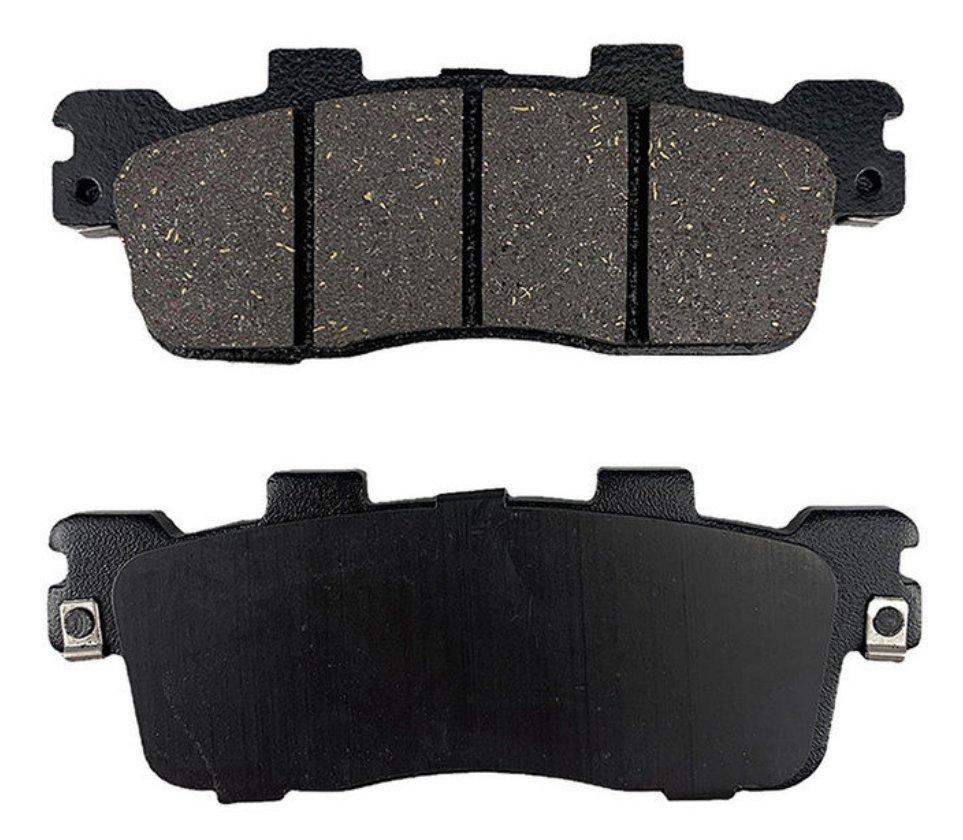
High temperature resistant and pollution free Delivers unrivalled pedal feel,safe and comfortable ATV brake pad